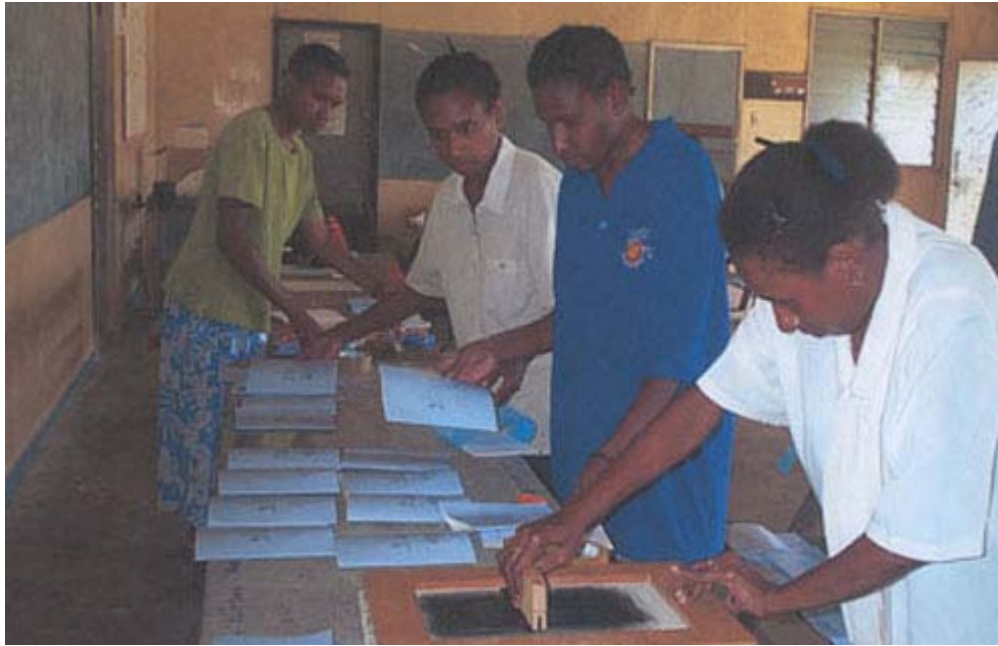
Daru teachers printing their shell books